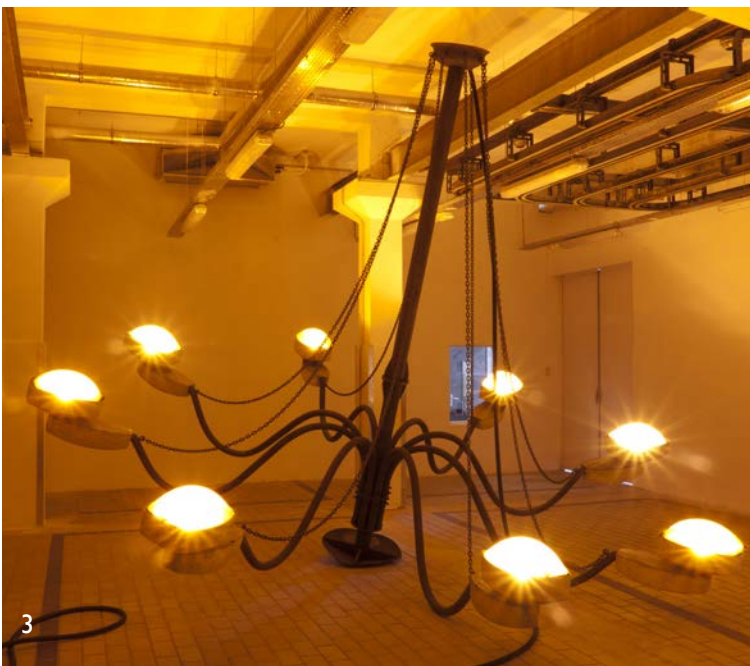
1. Main Entrance of La Station 2. Exhibition view of Back to the peinture , 2017 3. My Light Is Your Light , Kristof Kintera, 2008; Analysis Result , 2012 4. Lest , Delphine Reist, 2016; Flux Tendu , exhibition of Laurent Faulon & Delphine Reist, 2016