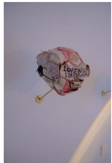
Justin SANCHEZ Untitled (balloons) 2017 balloons, brass variable dimensions