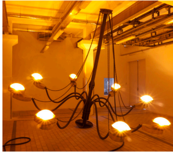
Kristof Kintera, My Light Is Your Light . View of the exhibition "Analysis Results", Kristof Kintera, La Station, Nice, 2012